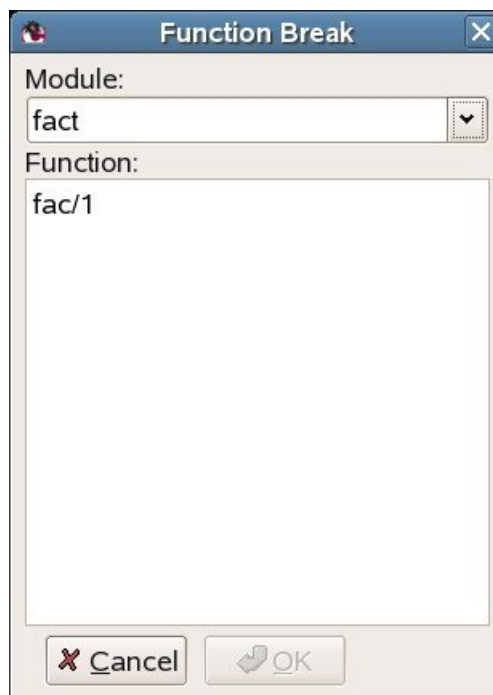
Figure 2.3: Function Break Dialog Window

A function breakpoint is a set of line breakpoints, one at the first line of each clause in the specified function.