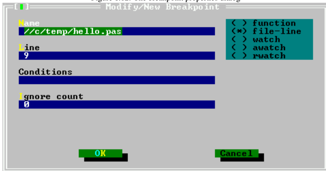
Figure 6.12: The breakpoint properties dialog

The dialog can be closed with the 'Close' button. The breakpoint properties dialog is shown in figure (6.12)