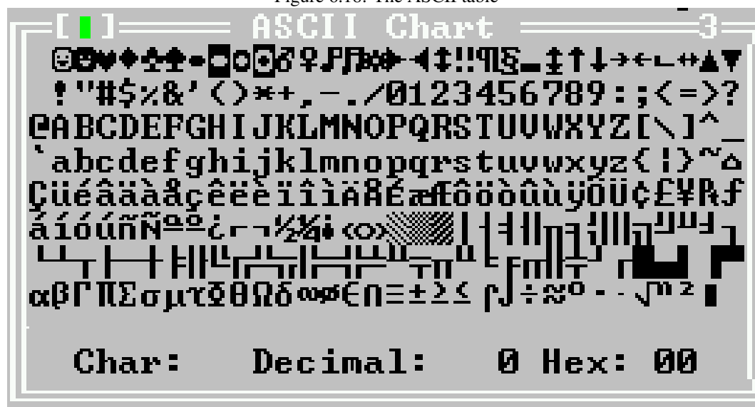
Figure 6.18: The ASCII table

The ASCII table remains active till another window is explicitly activated; thus multiple characters can be inserted at once. The ASCII table is shown in figure (6.18).